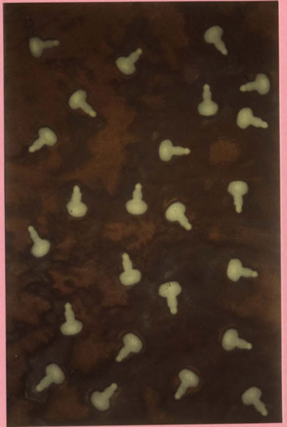
Rust canvas 5. 1996 150cm x 100cm.