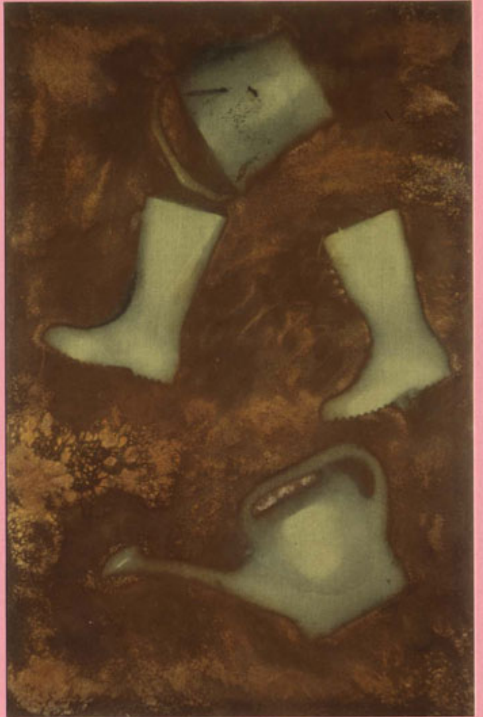
Rust canvas 8. 1996 150cm x 100cm.