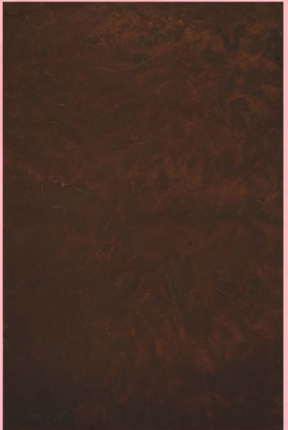
Rust canvas 7. 1996 150cm x 100cm.