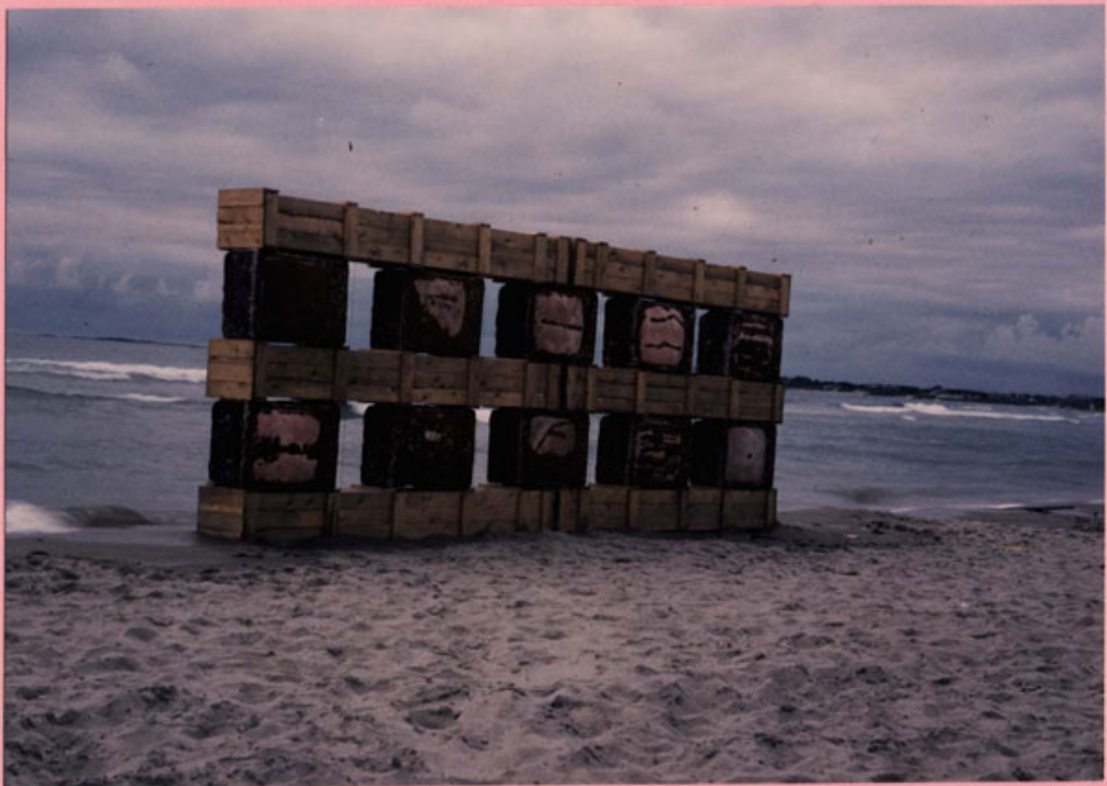
New Landscapes 1985 cast iron and stone, wood 8m x 3m x 80cm.