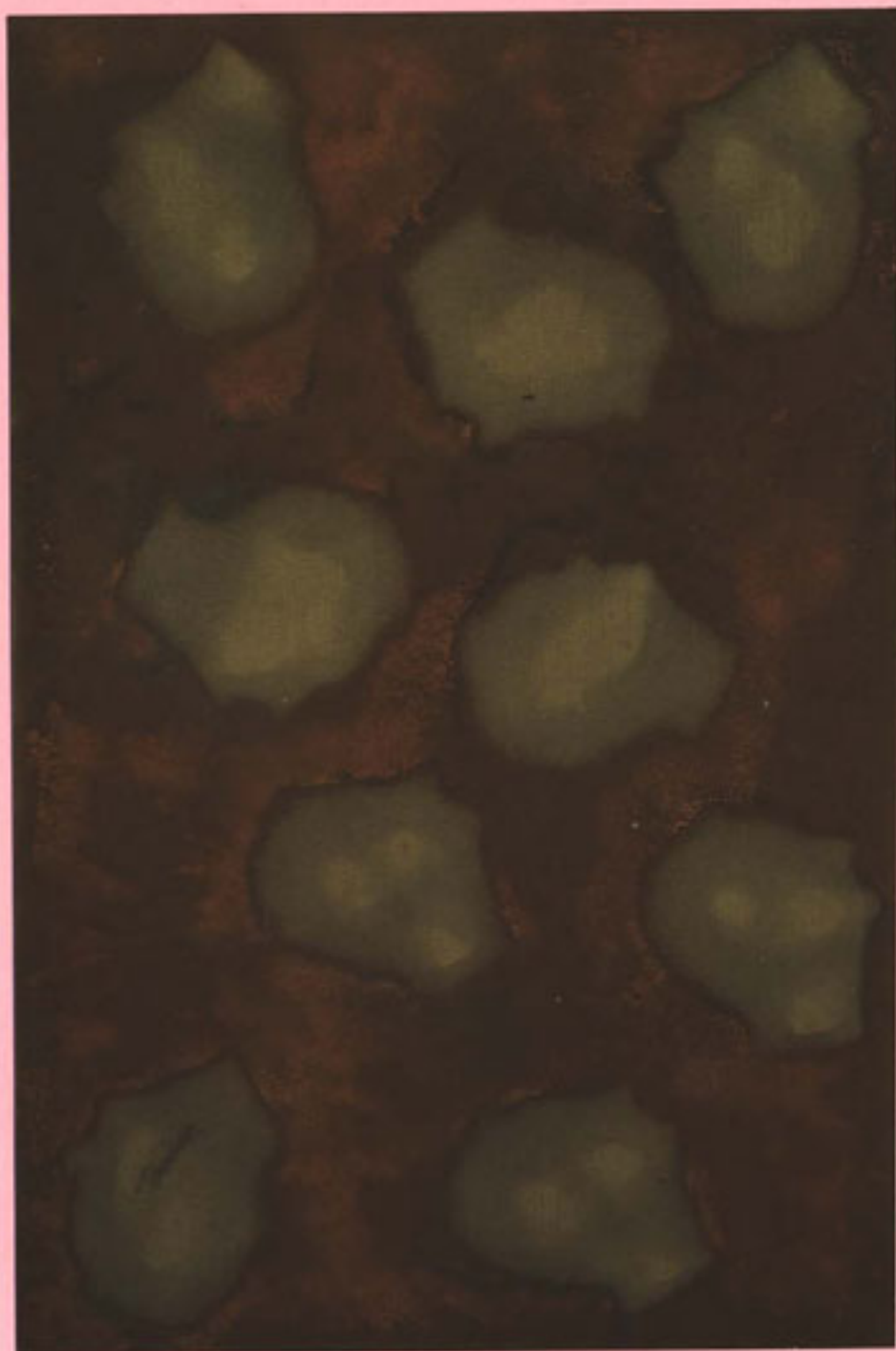
Rust canvas 3. 1996 150cm x 100cm.