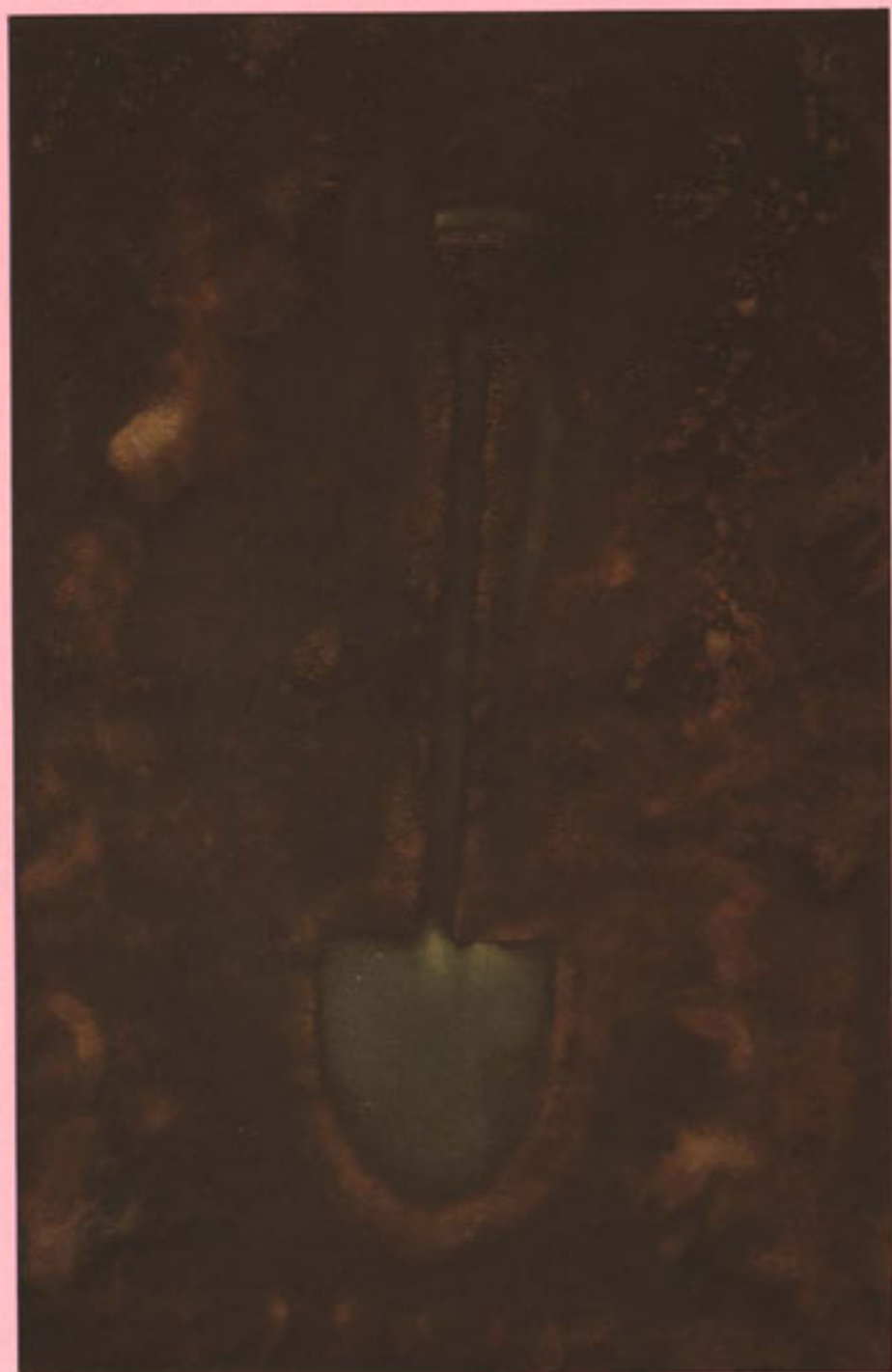
Rust canvas 1. 1996 150cm x 100cm.