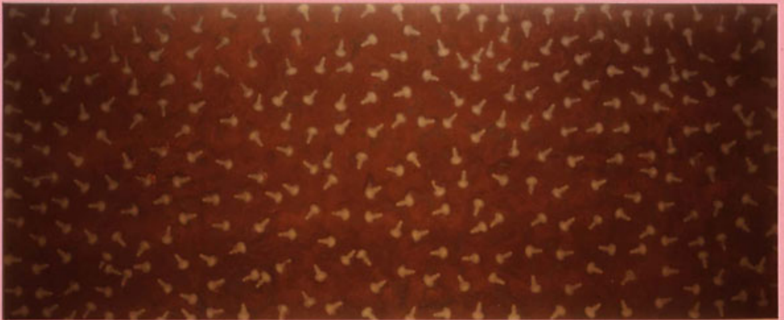
18 K.W. rust canvas 1997 5m x 2m.