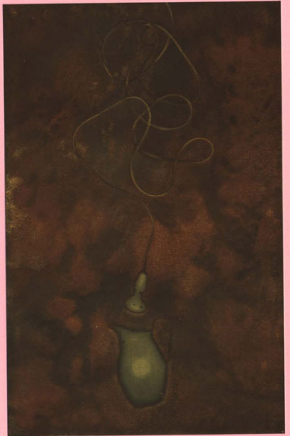
Rust canvas 9. 1996 150cm x 100cm.