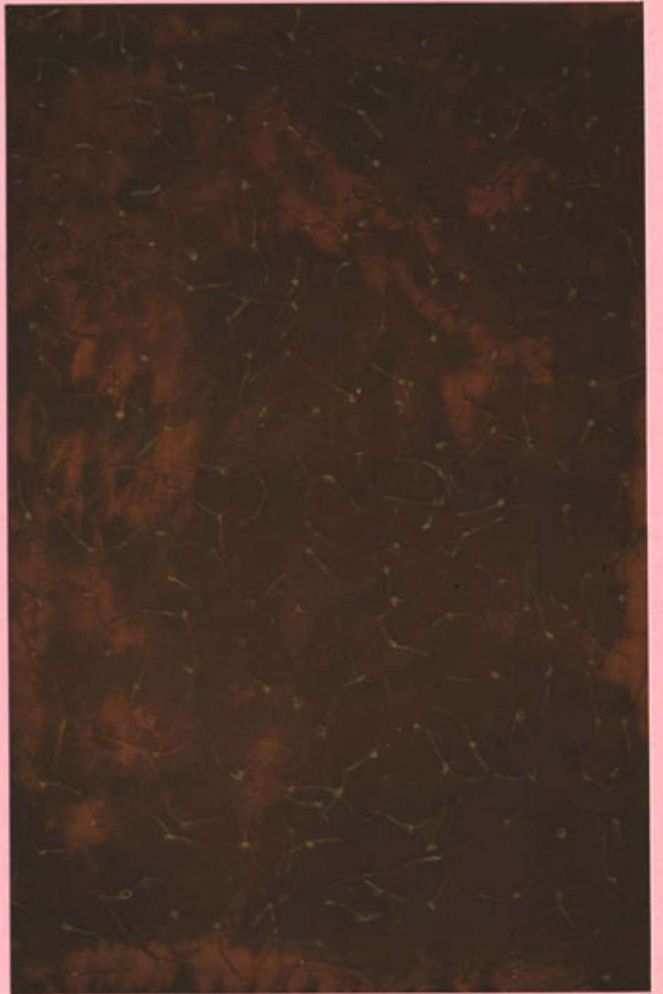
Rust canvas 4. 1996 150cm x 100cm.