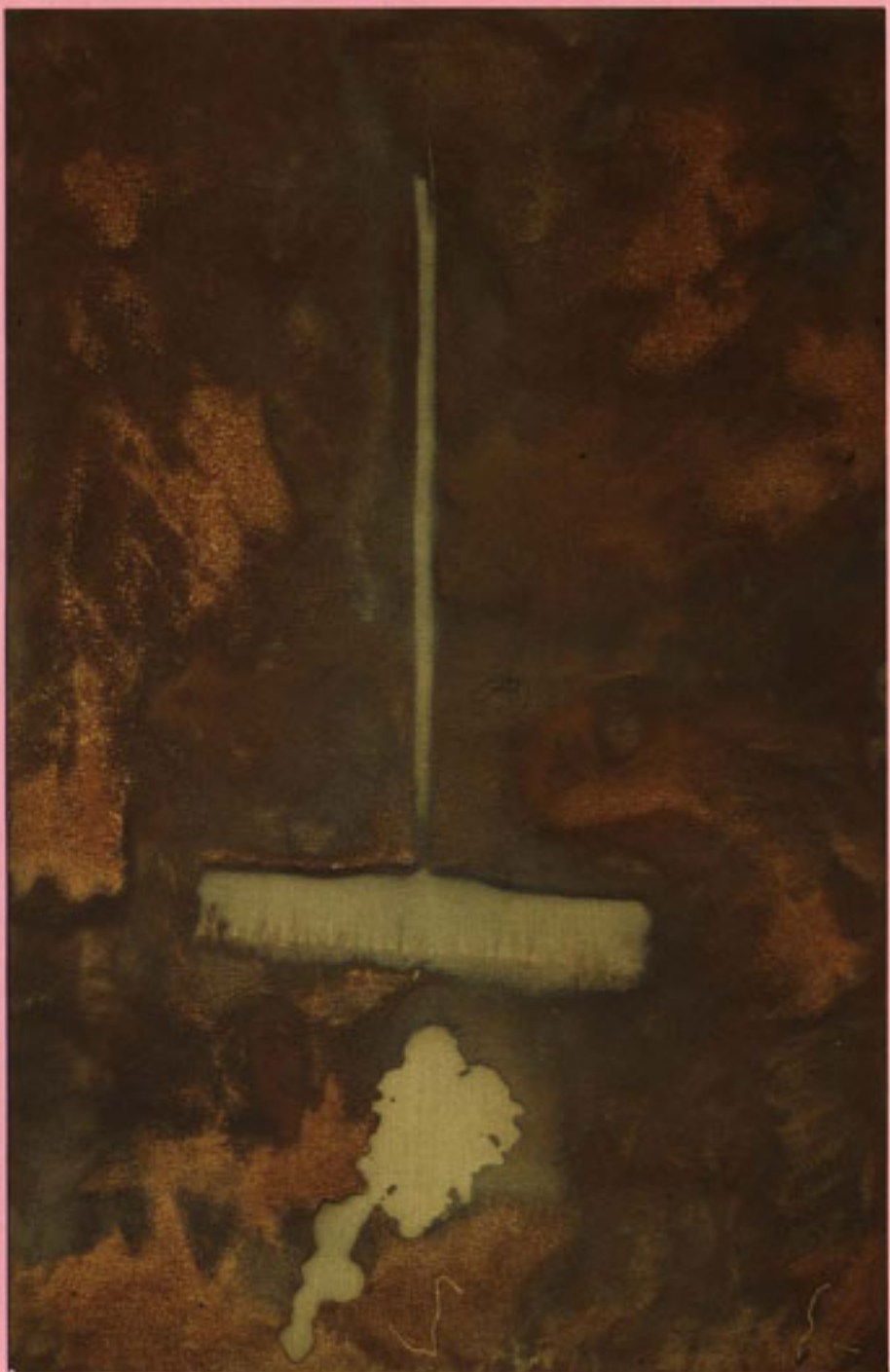
Rust canvas 10. 1996 150cm x 100cm.